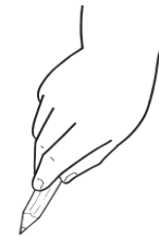
Pencil grip 2