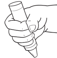
Pencil grip 1