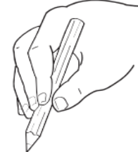
Pencil grip 3